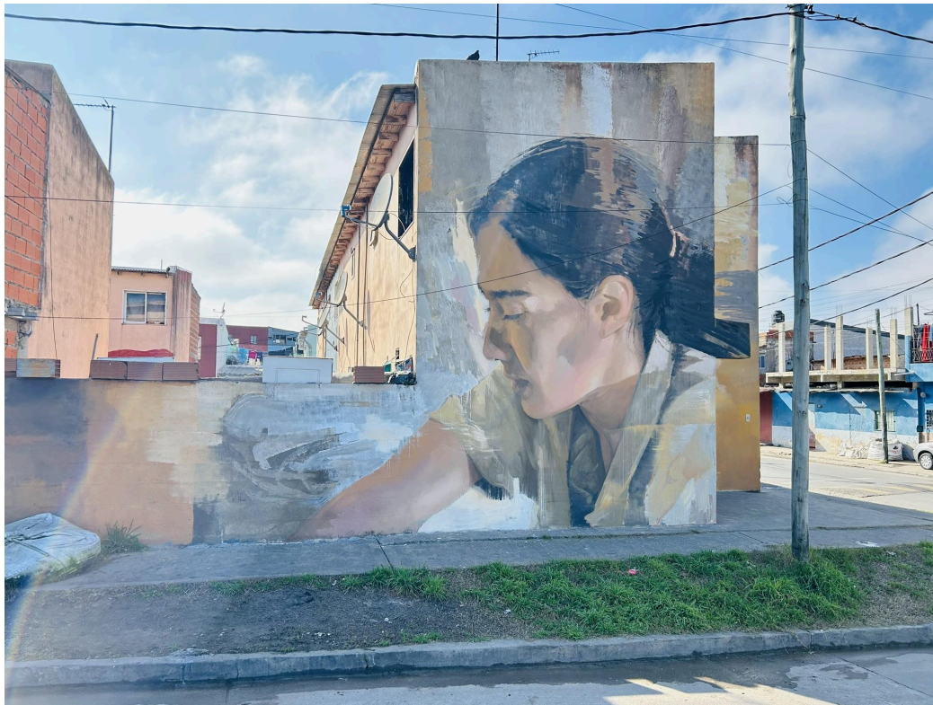
Mural of a Woman working, Isla de Maciel, July 2025