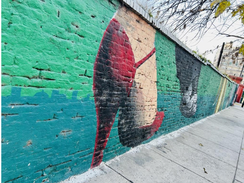
Street mural of the shoes of female and male tango dancers, Almagro, July 2025, Photo by Kristen McCleary