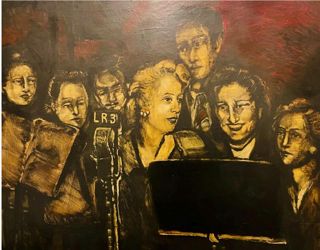
Women's Voices, Radio, National History Museum, Argentina, July 2025