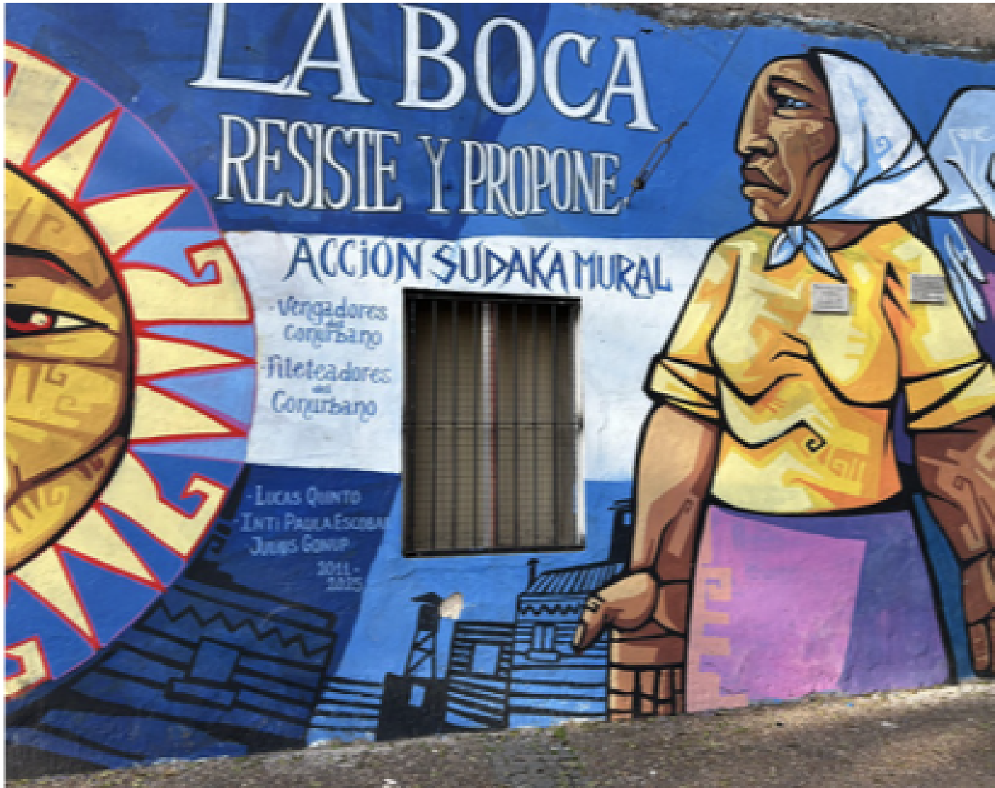
I recommend using the one below of a mural of the mothers of the Plaza de Mayo in the Esma compound, July 2023, Photo by Kristen McCleary.