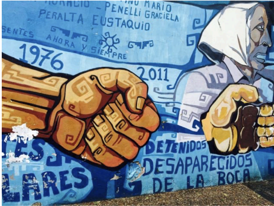
Mural of Mothers of the Plaza de Mayo, La Boca, Argentina, 2023