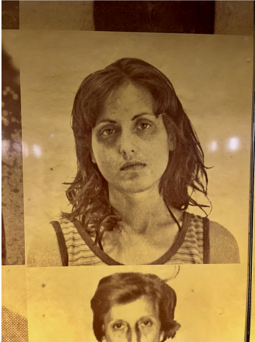
Mugshot of a woman arrested and held in Esma—likely disappeared, July 2023 [probably too depressing but there is a tortured woman in the play—I will use it for my class curriculum guide]