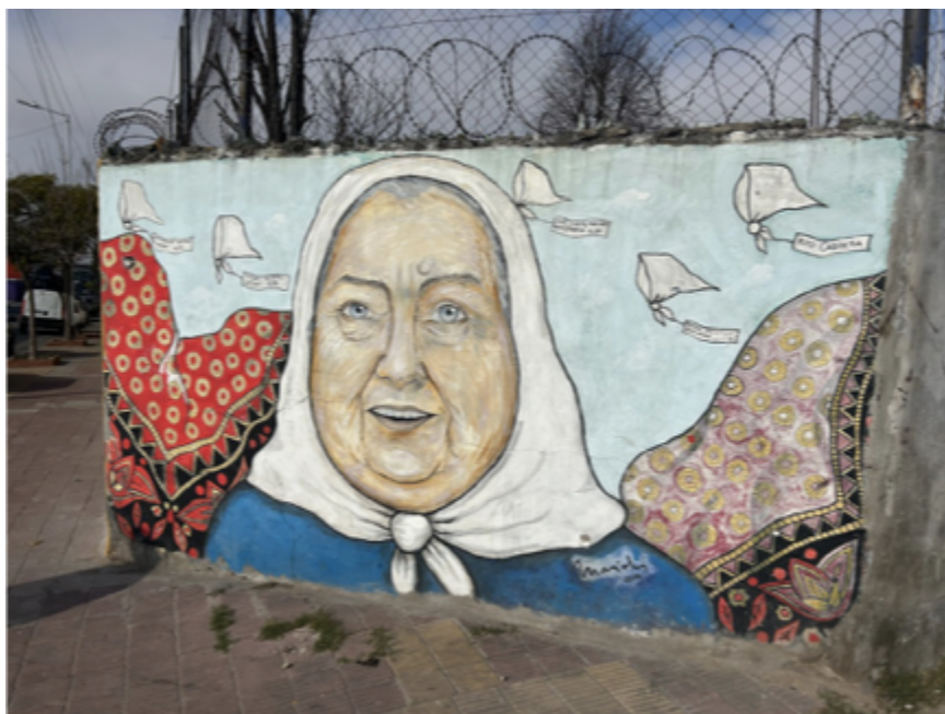
Hebe Bonafini, Mother of the Plaza de Mayo, Mural, Isla de Maciel, July 2025